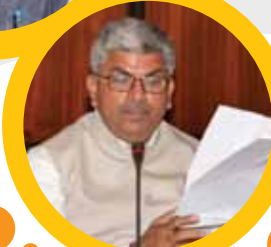
Mr. Ananda Bhaskar Rapolu, MP, Rajya Sabha