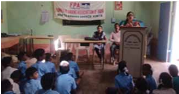
Babhrulingeshwara Vidhyalaya at Masoor