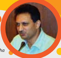
Dr. Kirit Premjibhai Solanki, Member of Parliament (MP), Lok Sabha