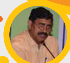
Mr. Jugal Kishore Sharma, MP, Rajya Sabha