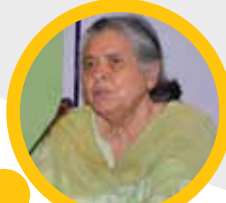
Ms. Viplove Thakur, MP, Rajya Sabha