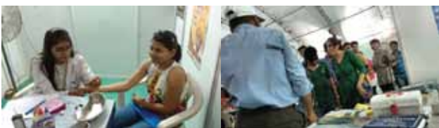
Exhibition stall at Vacation Mela 2016

An exhibition stall was set up at Vacation Mela-2016, in association with Gandhi Corporation. The objective of the stall was to expand the services and activities of FPAI Ahmedabad, while also advocating Sexual and Reproductive Rights (SRR). It was a high-footfall exhibition with up 1,00,000 visitors comprising of NGOs, CBOs, PMPs, teachers, school principals, students, young people, women and government health functionaries. The Branch provided education and services on SRHR through counselling, lab tests and IEC material. Visitors availed of information on HIV / AIDS, safe abortion, contraception, adolescent / youth related services, Gender Based Violence and so on. It was a great initiative that would generate leads for FPAI or RHFPIC in the future. The stall, which was procured free of cost by FPAI, was up from ten days from May 21, 2016 at the Gujarat University Education Ground.