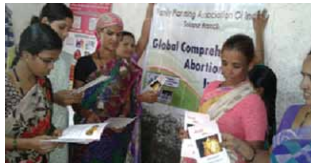
Meeting with Govt. Health Workers (ASHA Workers)