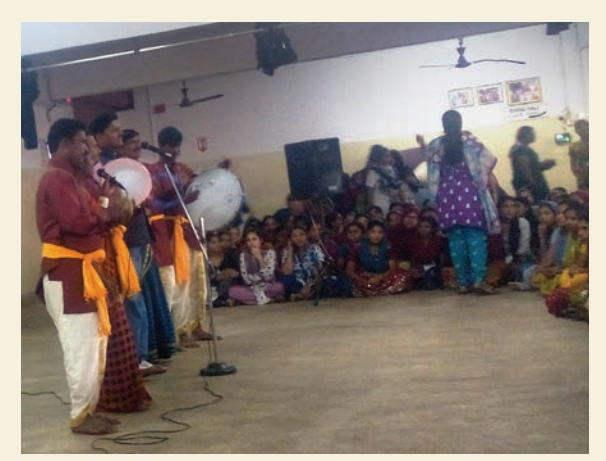
Music to the Ears: Artists perform to spread awareness on World AIDS day at Bangalore