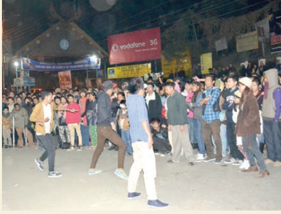
Dance troupe performing Flash Mob during World AIDS Day Awareness Week at the Hornbill Festival - Night Carnival