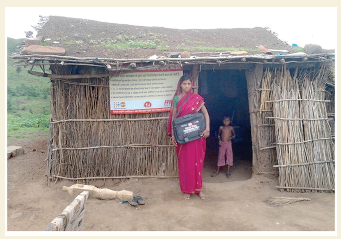
A bag of hope. FPA India empowers rural women