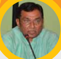
Mr. Ananth Kumar Hegde, MP, Lok Sabha