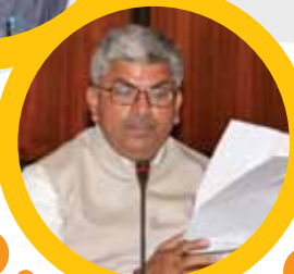
Mr. Ananda Bhaskar Rapolu, MP, Rajya Sabha