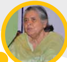
Ms. Viplove Thakur, MP, Rajya Sabha