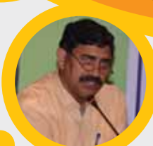
Mr. Jugal Kishore Sharma, MP, Rajya Sabha