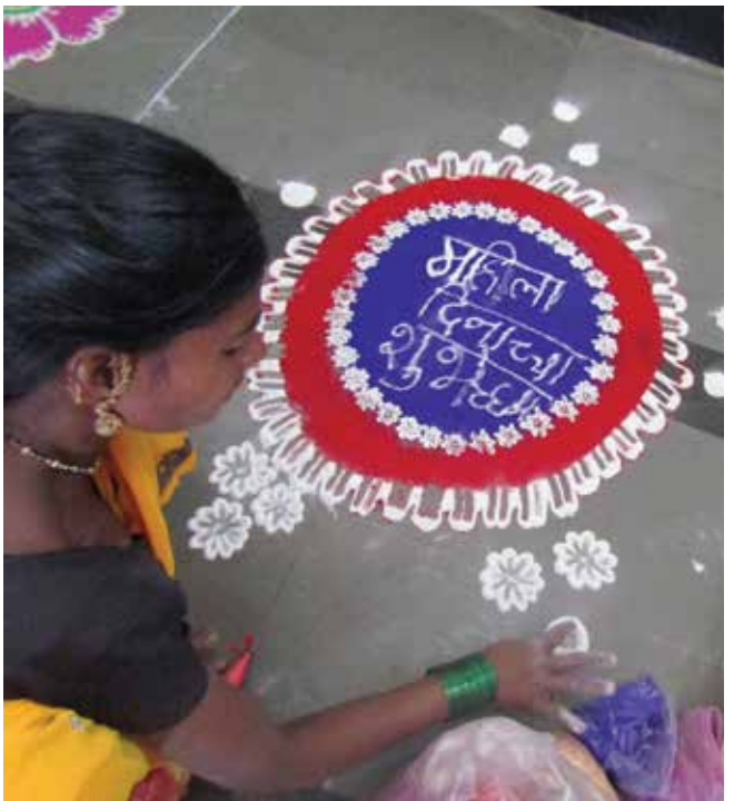
Rangoli Competition on International Women's Day at Ubale Samaj Mandir, Shelgi.