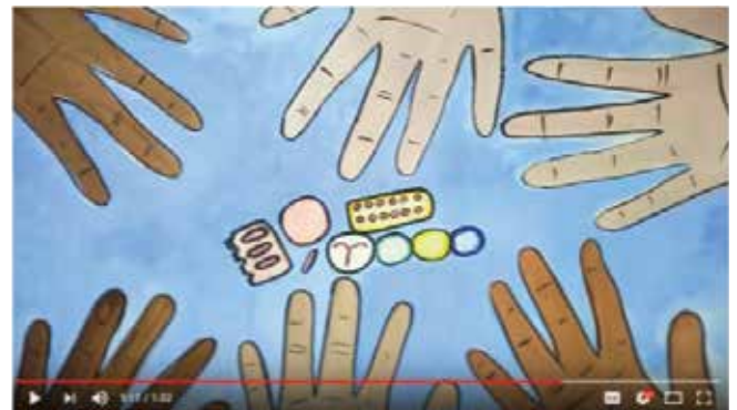
A Snippet of the 'I Decide' Short Film

https://www.youtube.com/watch?v=ejbC7mijMzA