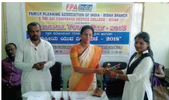
Prize Distribution to Winners of Elocution Competition