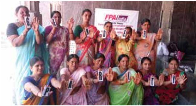
Press for Progress for Gender Parity