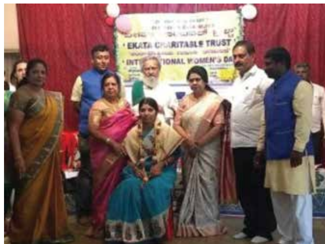
FPA India, Bengaluru, felicitating women on International Women's Day, 2018.