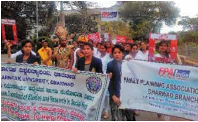
Participants at a Rally

Four CSE training programmes were organised for 117 participants - peer educators, community mobilisers, facilitators, and master trainers. The main aim of the programmes was to extend their services to a larger audience and to reach the unreachable. Topics like sexual rights, gender and GBV, sexuality, pleasure, interpersonal relationships, communication & decision making skills, puberty, and reproductive health were covered. Thirteen trainees are working on CSE sessions.