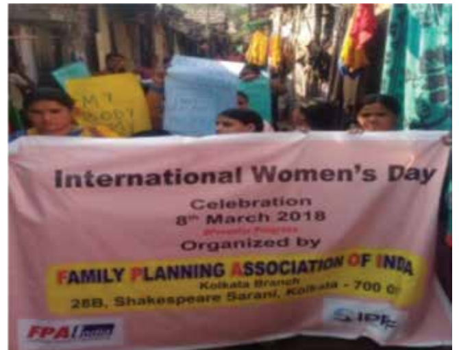
Rally at Topsia slum area on International Women's Day

Field areas of satellite units in Topsia also observed this day with 68 women. Discussions on SRHR of women and menstrual health & hygiene were also conducted with mothers. Hundred participants from the rural area of Rajarhat, Kolkata, also participated in singing, dramatics, and poetry recitation about women empowerment, on this occasion.