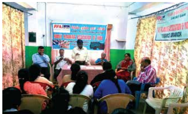
Gender Parity Session in Progress