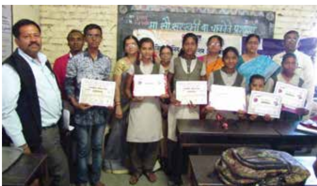
Winners of Drawing Competition felicitated with Certificates

A health awareness programme was conducted for an adolescent group at Saraswati Baburao Chakote Pathshala in collaboration with the Inner-Wheel Club. Drawing competition was organised for the students. Winners were felicitated with prizes and certificates of appreciation.