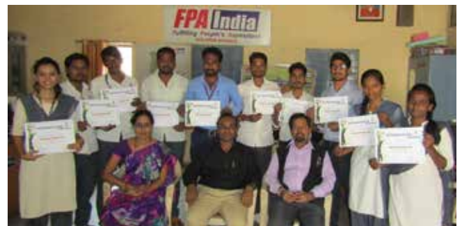
Students felicitated with Certificates on National Youth Day