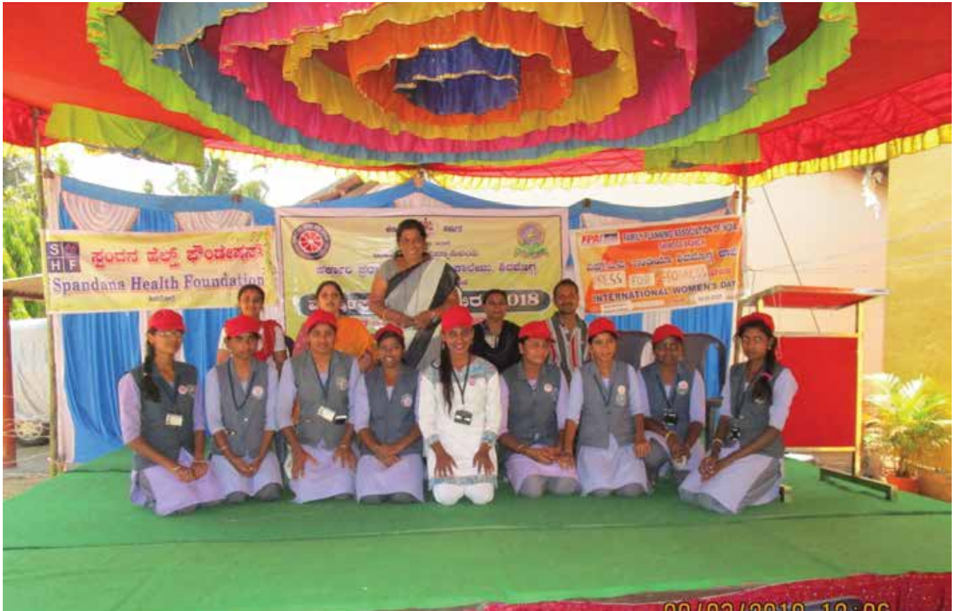
International Women's Day in collaboration with Spandana Health Trust & Govt. Women's College