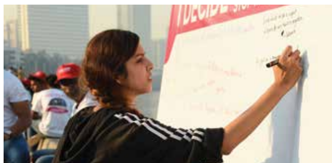
A visitor signing the #I Decide Campaign

The Family Planning League (FPL) was introduced to encourage the FPA India branches to actively be a part of this initiative and help raise funds for this cause. Branches were divided into five teams – FPAI Kings, FPAI Knights, FPAI Warriors, FPAI Stunners, and FPAI Champions, who collectively mobilised funds. FPAI Kings (Jabalpur, Lucknow, Rajkot, Jaipur, Bhubaneswar) was declared winner of FPL for raising INR. 167504/-. FPA India Gwalior, Panchkula, Bengaluru, Bidar, Thane District Project (TDP), Mumbai, Kalchini, Pune, Dharwad, Murhu, Jabalpur, Bhubaneswar, Vijayapur, Yamunanagar, Rajkot, Dindigul, Kolkata, Bhopal, Agra, Ahmedabad, Mohali, Nagaland, Solapur, Lucknow, Chennai, Indore, Madurai, Shivamogga, Trivandrum, Hyderabad, Jaipur and Nilgiris mobilised funds for the cause.