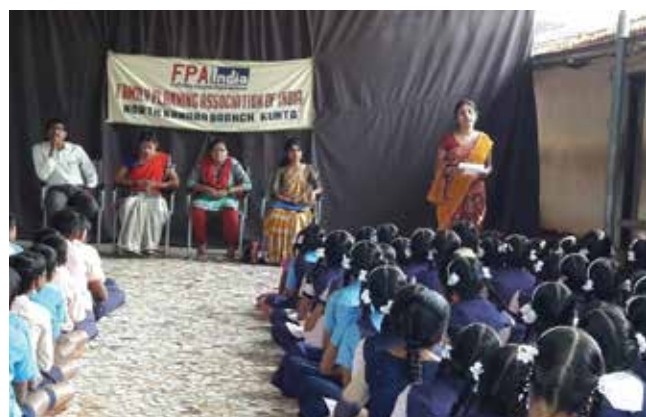
Awareness programme for students