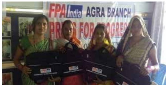
Celebration of International Women's Day