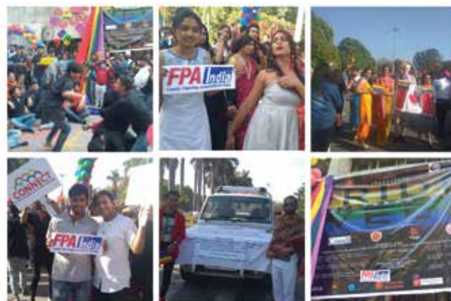
Pride Walk to Decriminalise IPC Section 377

A skill training programme was organised for 40 women at Sindh Rural Self Employment Training Centre, Kumta. The training helped the women develop their skills and gain self-employment.