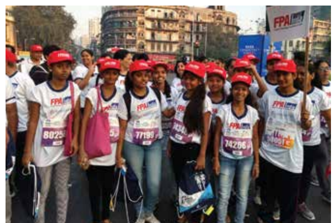
Thirteen Adolescent Girls leading the FPA India Contingent

Intra-Uterine Device manufacturer in India) also showed support for our cause by sponsoring charity bibs for employees or representatives from their senior management.