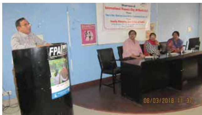
International Women's Day Session in Progress