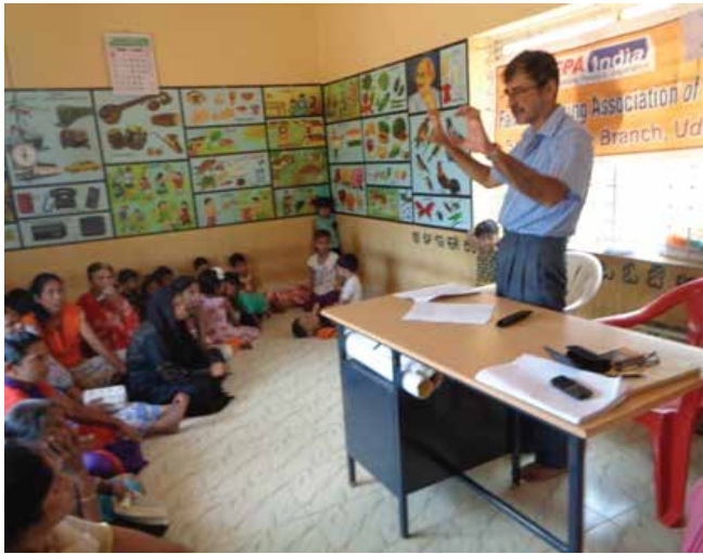
Awareness Programme with Anganwadi Teachers on Leprosy