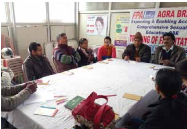
Meeting with CBOs and Parents

Discussions on Adolescents' and SRH needs were facilitated for 23 participants. Community Based Organisations (CBO) emphasised the necessity to provide SRH knowledge to both youth and parents in today's world. Parents also felt that the youth today should be informed and educated on health-related topics and were supportive of the idea. CBOs and parents were interested in getting SRH knowledge but at the same time were reluctant in providing knowledge to their students.