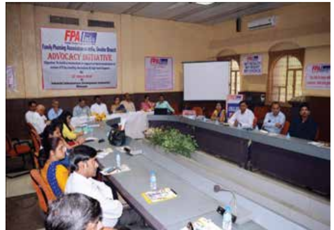
Advocacy Initiative by FPA India, Gwalior, with PLHIV and CSOs working for HIV prevention

on sexual health care & gender were highlighted. A documentary based on stigma, discrimination, and social problems faced by these groups was screened. The programme received a positive feedback and 47 participants gave their written consent to support decriminalisation of IPC section 377.