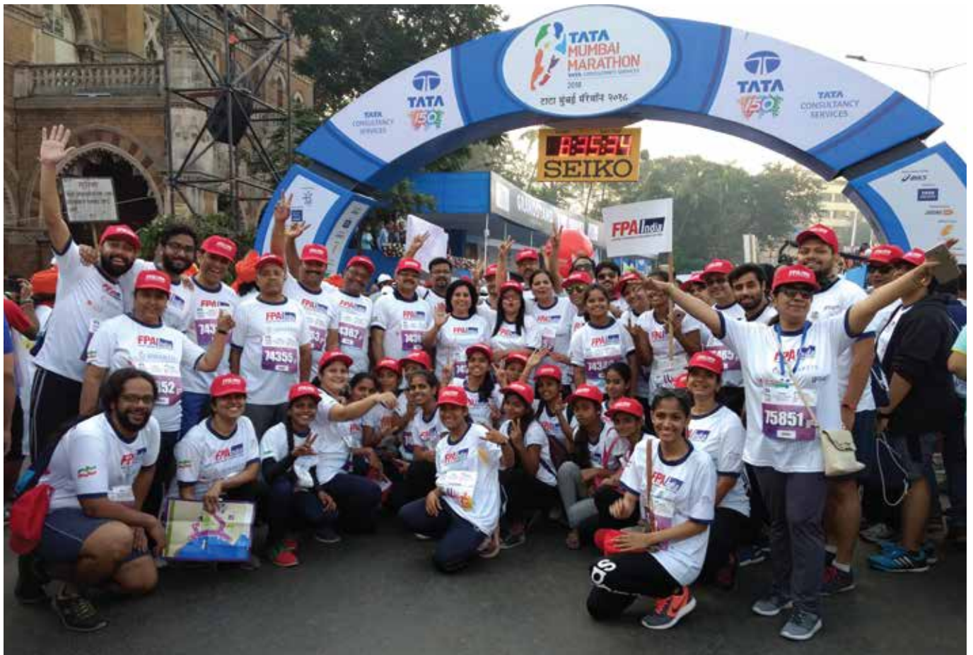
FPA India team at the Tata Mumbai Marathon, 2018, flag-off point