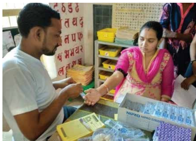
Health Check-Up for Women

A special health check-up session was organised in coordination with Tata Power Community Development Trust, Mumbai. The main objective of the project was to provide SRH services and educate the community on SRH care. Seven special sessions were conducted for community members and young people. Primary screening was done by gynaecologists and they were further counselled, investigated and treated. A comprehensive health check-up especially for women with gynaecological disorders and problems was conducted. Investigations included pap smear test, haemoglobin test, blood group identification, sugar and lipid profile tests.