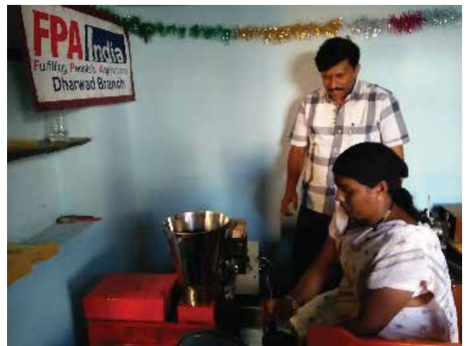
Incense Stick making as a part of the Income Generation Activity

Training programme was organised for women in coordination with Bhasavashree Foundation. This was an income generation activity of making incense sticks aimed at empowering women. Women were taught how to make incense sticks. One link worker has independently started preparing it at home.