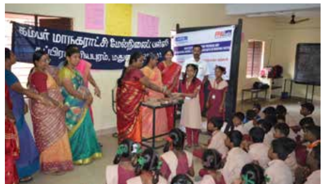
Nutrition Packs distributed to students for increasing Haemoglobin level

A special HB testing session and Sexual and Reproductive Health (SRH) service session was conducted for government schools students in partnership with HCL Foundation. 630 students benefited through this screening session. They also distributed 155 Nutrition Packs for some school students.