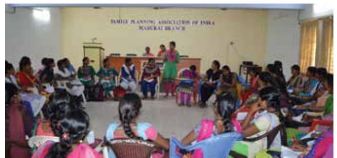
Gender and Equality session for Adolescent girls

A special HB testing session and Sexual and Reproductive Health (SRH) service session was conducted for government schools students in partnership with HCL Foundation. 630 students benefited through this screening session. They also distributed 155 Nutrition Packs for some school students.