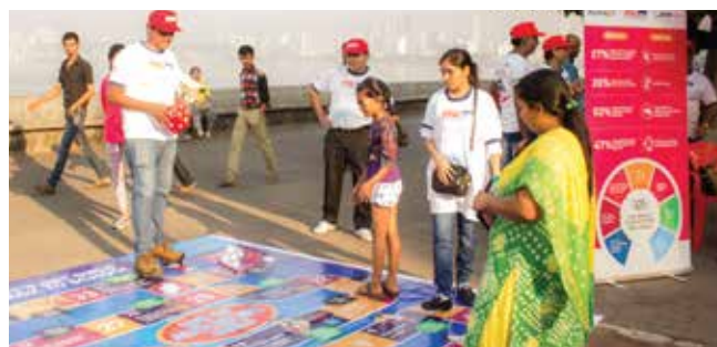
Participants playing the 'Game of Life – For Adolescent Girls'

A motivational cheer zone was set up on Marine Drive, Mumbai, on 21st January. Twenty-nine youth volunteers from Mumbai Branch participated. A giant-sized board game called 'The Game of Life – For Adolescent Girls', was organised at the cheer-zone. Besides, an 'I Decide' signature campaign was carried out to encourage people to share their thoughts on "how periods should not be a full stop to a girl's life and education". All this encouraged more people to visit our cheer zone to support our cause.