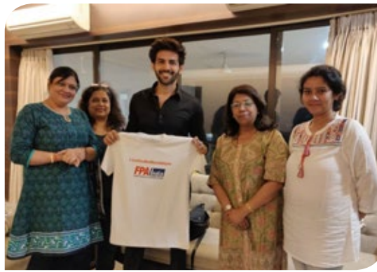
Revealing the first look of FPA India's official T-shirt in TMM 2019