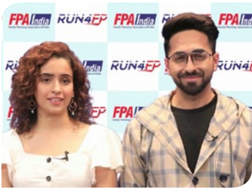
Celebrities Sanya Malhotra and Ayushmann Khurrana