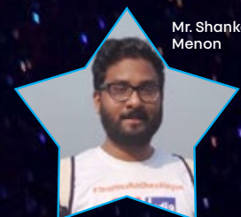
Mr. Shankar Menon